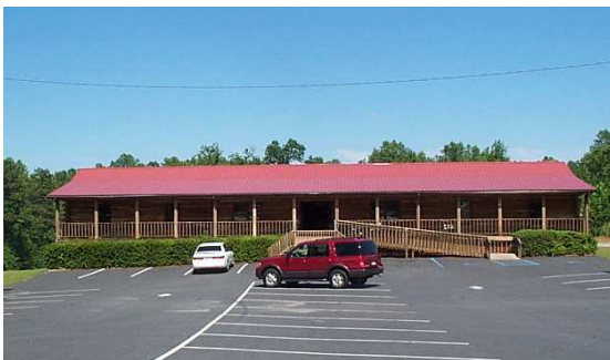
The “Country Store”

A Prayer For The Day: Spirit of God, send your healing touch to sooth my spirit, calm my heart, and restore my energy, Amen.