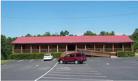
“The Country Store”

Our Mission - Inviting all to gather and grow in service to Christ