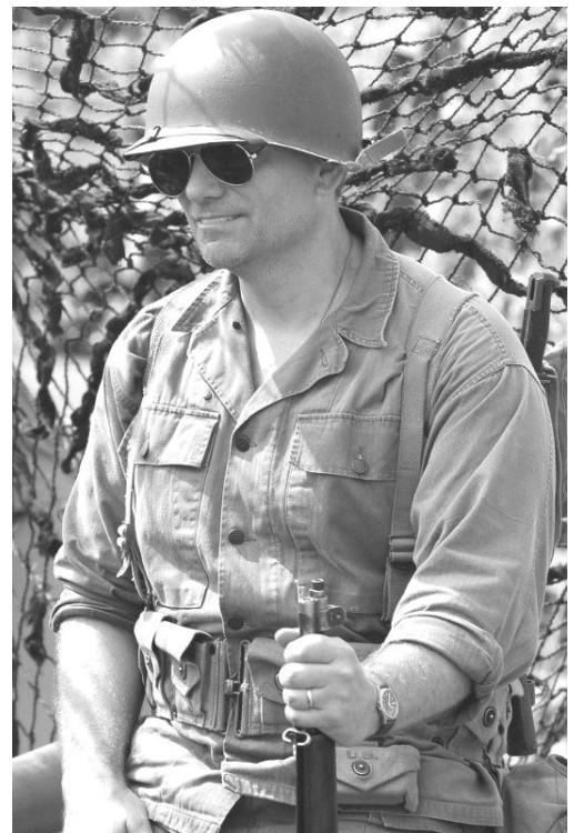
The June 2008 Reading Air Show Poster Boy